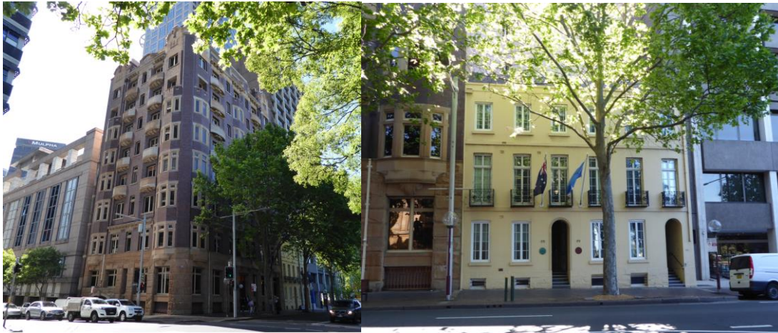
Figure 6: Wyoming (left) and Horbury House (right)