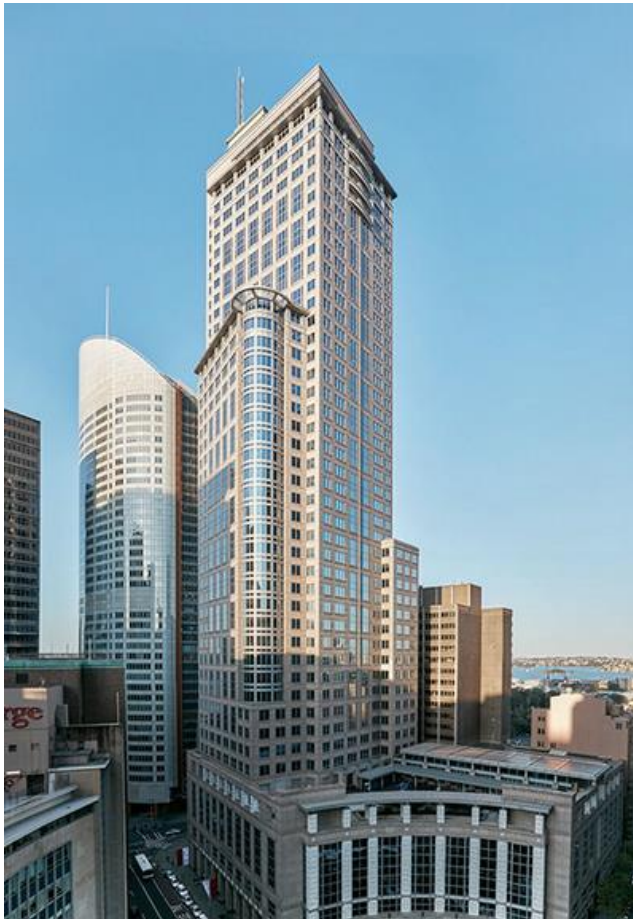
Figure 3: Existing Chifley Tower and podium