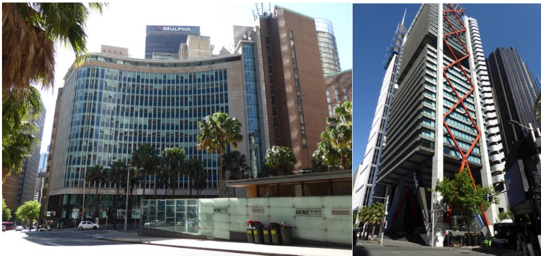
Figure 5: Qantas House (left) and 8-12 Chifley (right)