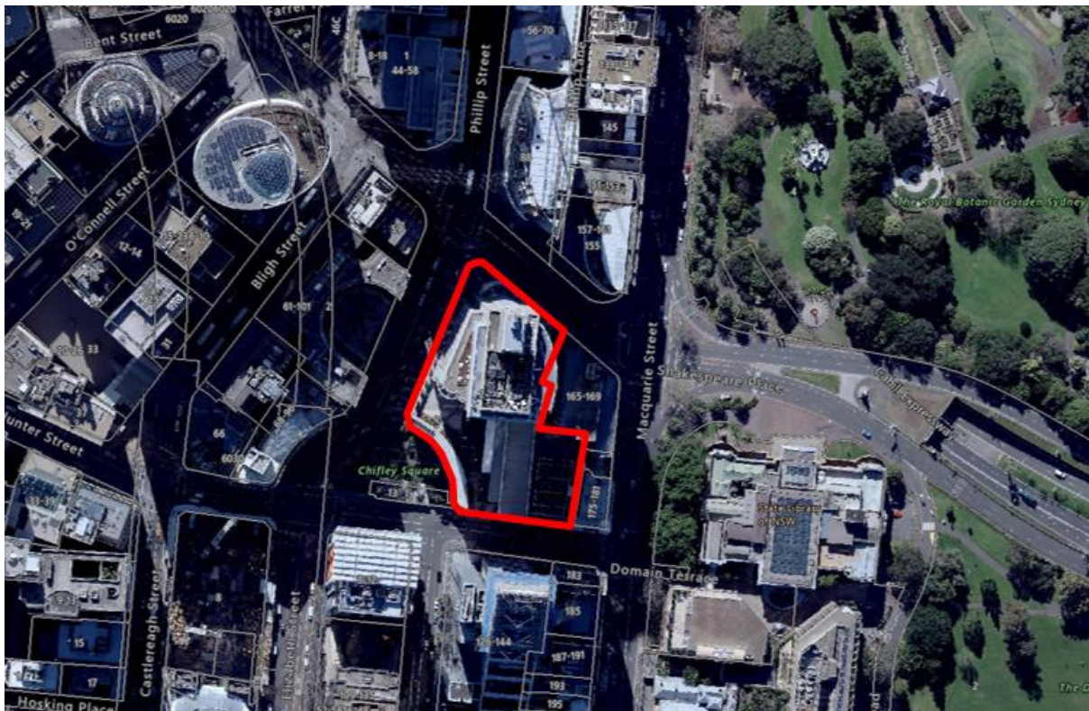
Figure 2: Aerial Photo of site