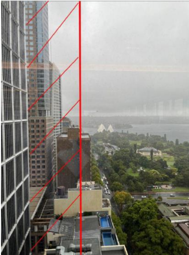
Figure 8: Photo from the Investa submission with estimated view loss from 60 Martin Place