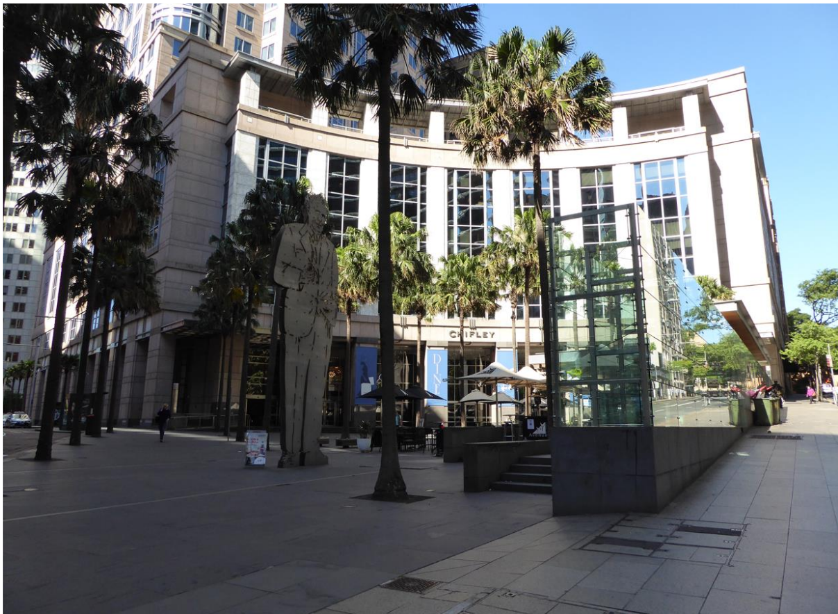
Figure 4: Chifley Square